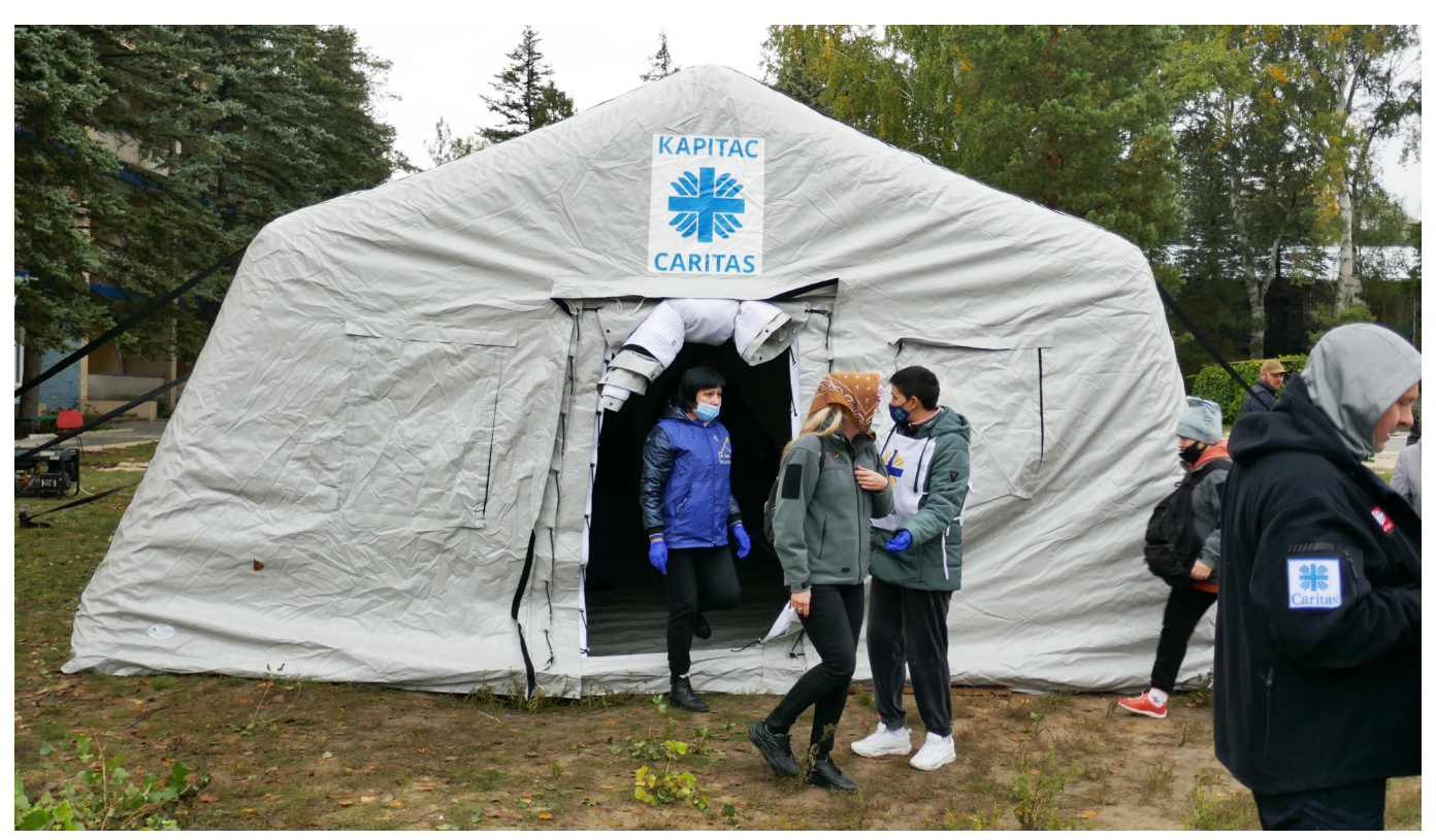
Caritas Ukraine teams conducted emergency simulations in October last year in preparation for a potential humanitarian crisis.

As reports emerge of families being displaced by the recent attacks in Ukraine, Catholic Relief Services is helping Caritas teams prepare to respond to urgent humanitarian needs across the country—including for evacuation, food and safe shelter—while taking every precaution to ensure the safety of their staff.